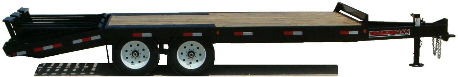
(Pictured with Optional 5’ Dove and (3) 5’ Flip Over Ramps)