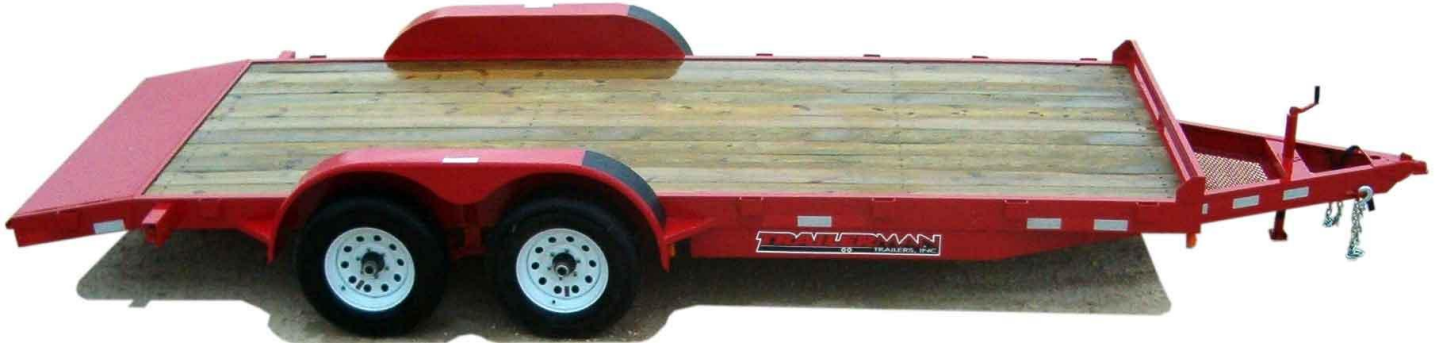
(Pictured with Optional Open Mesh Tray in Tongue)