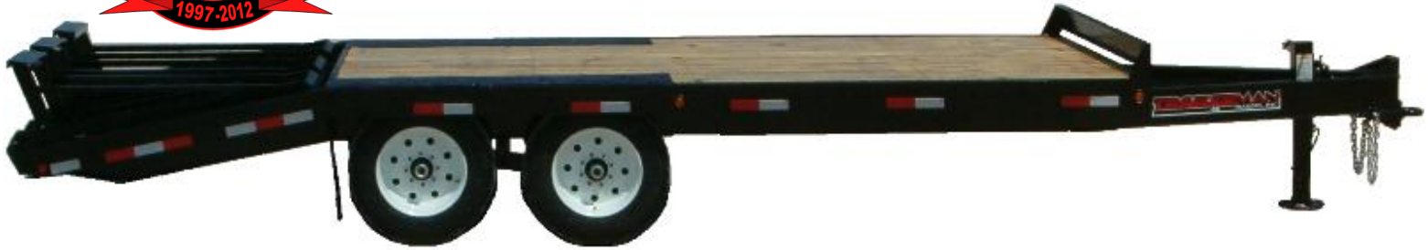
(Pictured with Optional 5’ Dove and (3) 5’ Flip Over Ramps)