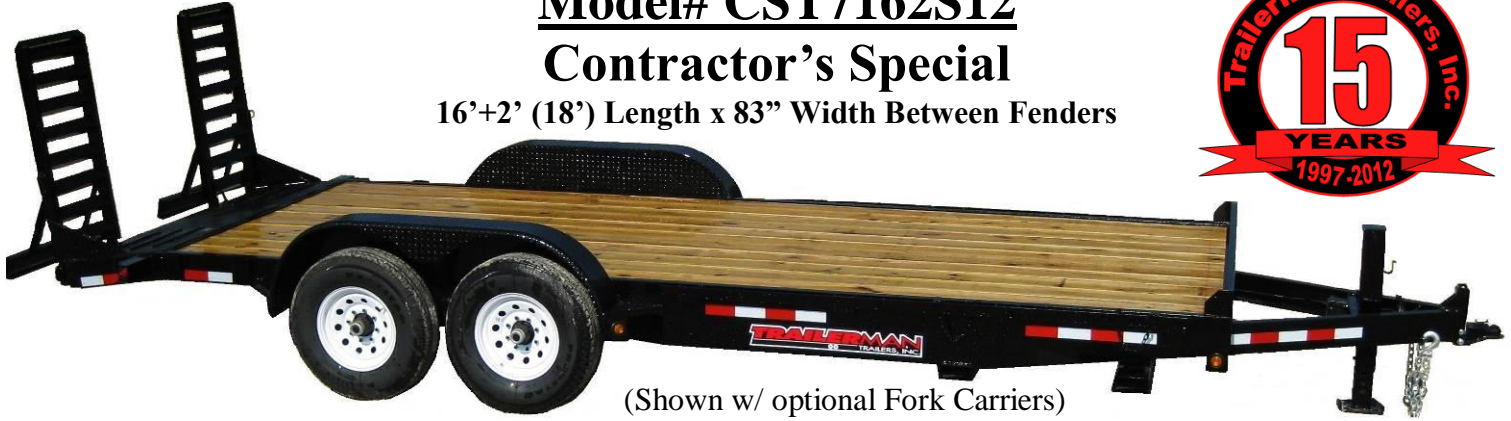
(Shown w/ optional Fork Carriers)